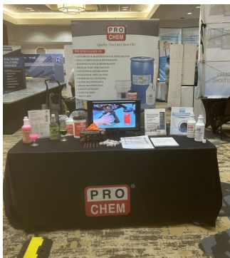
SC Hospital Engineer's Tradeshow