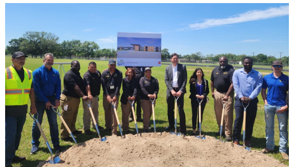
Groundbreaking Event—City of Port Arthur's New Animal Shelter