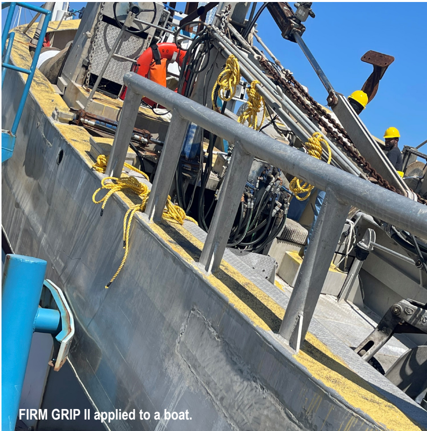
FIRM GRIP II applied to a boat.