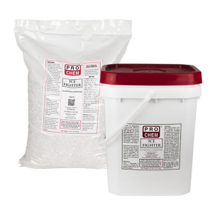
ICE FIGHTER #3463 For snow and ice removal.