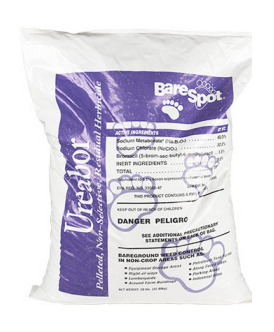
UREABOR #2810 Granular, non-selective residual weed and grass killer.