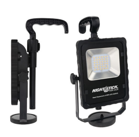
RECHARGEABLE AREA WORK LIGHT #4458/#4459 Magnetic Base/AC & DC rechargeable/Power outages/ Dimly lit areas.