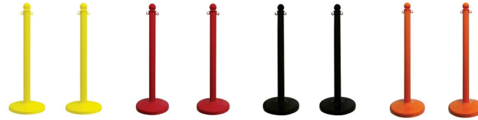
Single 964-02 Case of 6 964-02-6