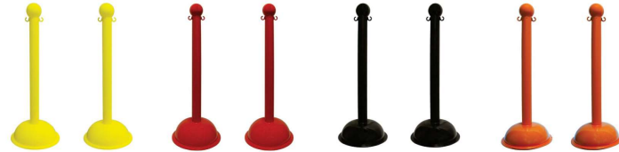
Single 999-02 Case of 6 999-02-6