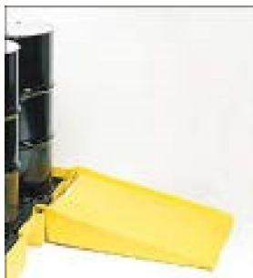
431301 – Poly Ramp (45 1/2" L x 32" W x 8" H)