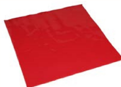
430501 36" x 36"