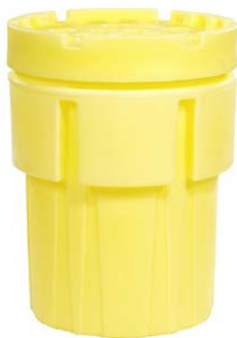
430801 - 20 gl (28.25" W x 37.37" L x 28.25" H) 430901 - 30 gl (23" diam x 30.75" H) 431001 - 65 gl (28.25" diam x 37.5" H) 431101 – 95 gl (32" diam x 41.5" H)