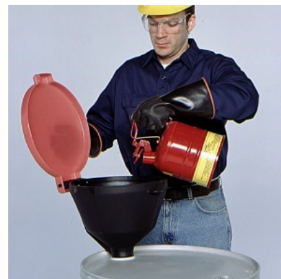
430701 – Burp Free Funnel (13.375" diam x 11" H)