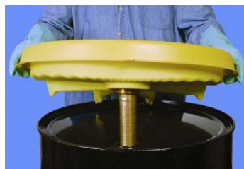
430601 – Drum Safety Funnel (26" diam x 5.5" H)