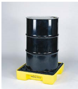
430001 – 1 Drum (no drain) (26 1/4" W x 26" D x 6 1/2" H)