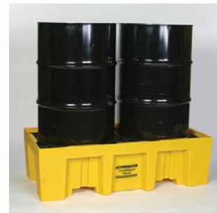
430201 – 2 drum (with drain) (51" W x 26 1/4" D x 13 3/4" H)