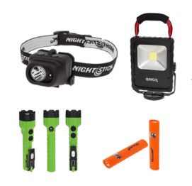
AREA LIGHTS AND HEAD LAMPS For use on overcast/cloudy days; inclement weather.