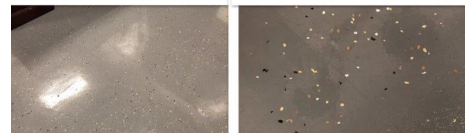
Before & After picture of DURA SEAL.