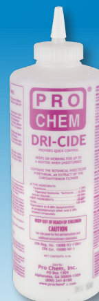
DRI-CIDE #3508 Ready-to-Use Crack and Crevice Powdered Insecticide