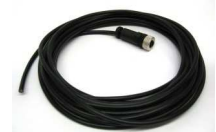
Wire Extension Kits