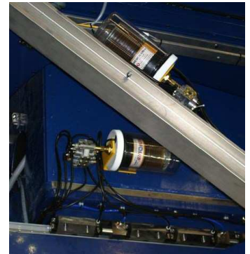
Production equipment application