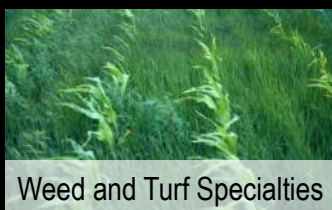
Weed and Turf Specialties