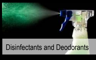
Disinfectants and Deodorants